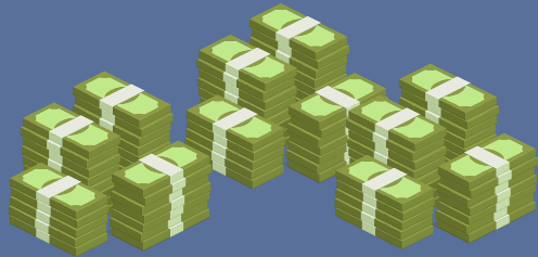
$1 Billion in Construction Spending

Government-mandated project labor agreements needlessly increase the cost of taxpayer-funded construction projects by 12% to 20% , meaning fewer construction projects or more cuts to other programs—and less job creation.