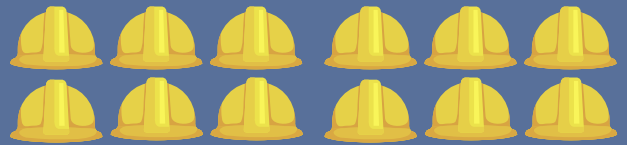
3,550 Construction Jobs

Government-mandated project labor agreement schemes stifle construction industry job creation by wasting taxpayer dollars, resulting in fewer infrastructure improvements and new construction projects.